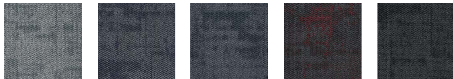
Rebirth-06 Rebirth-07 Rebirth-08 Rebirth-09 Rebirth-10