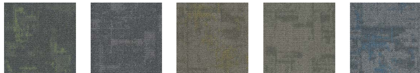
Rebirth-01 Rebirth-02 Rebirth-03 Rebirth-04 Rebirth-05